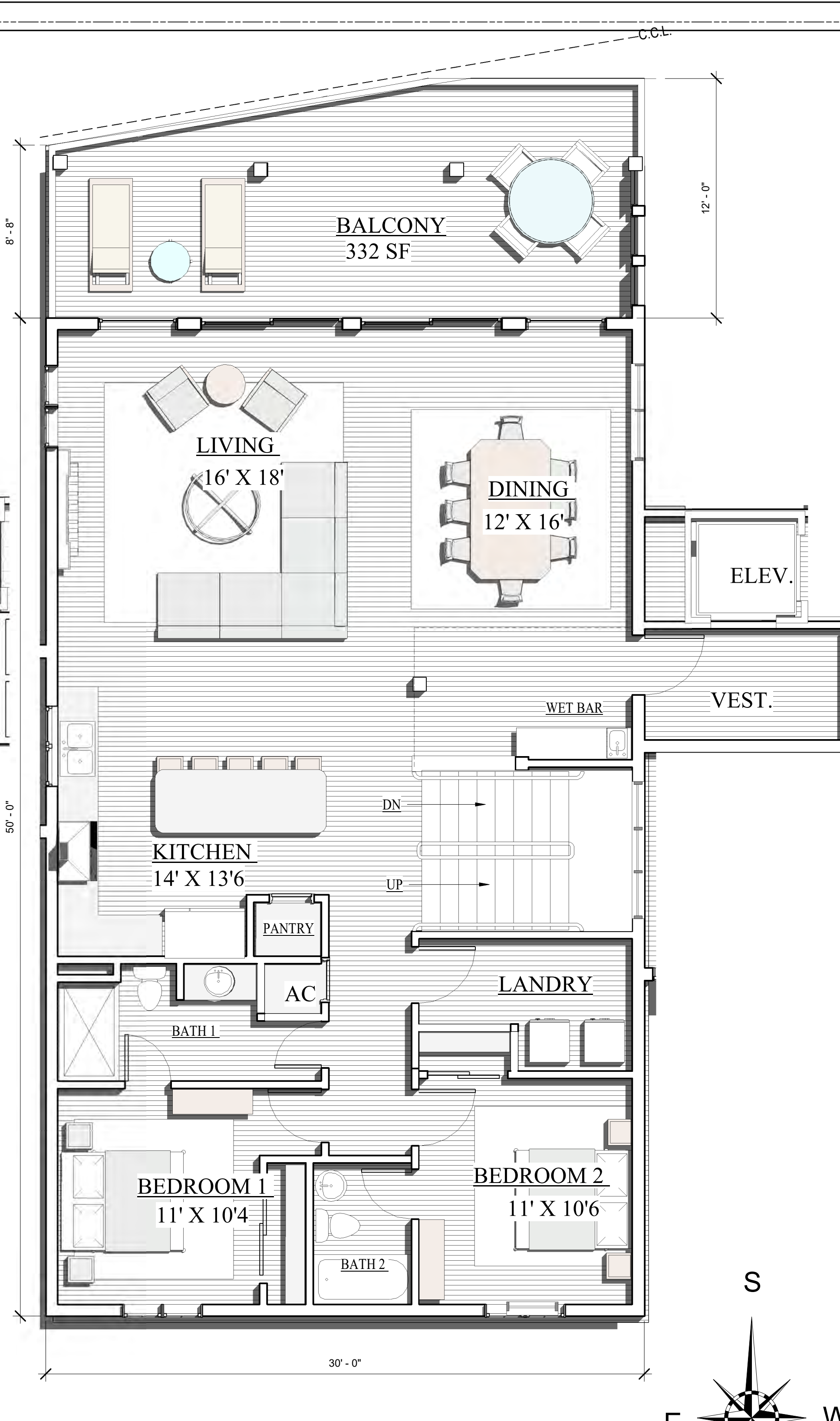
UNIT 1 2ND LEVEL FLOOR PLAN