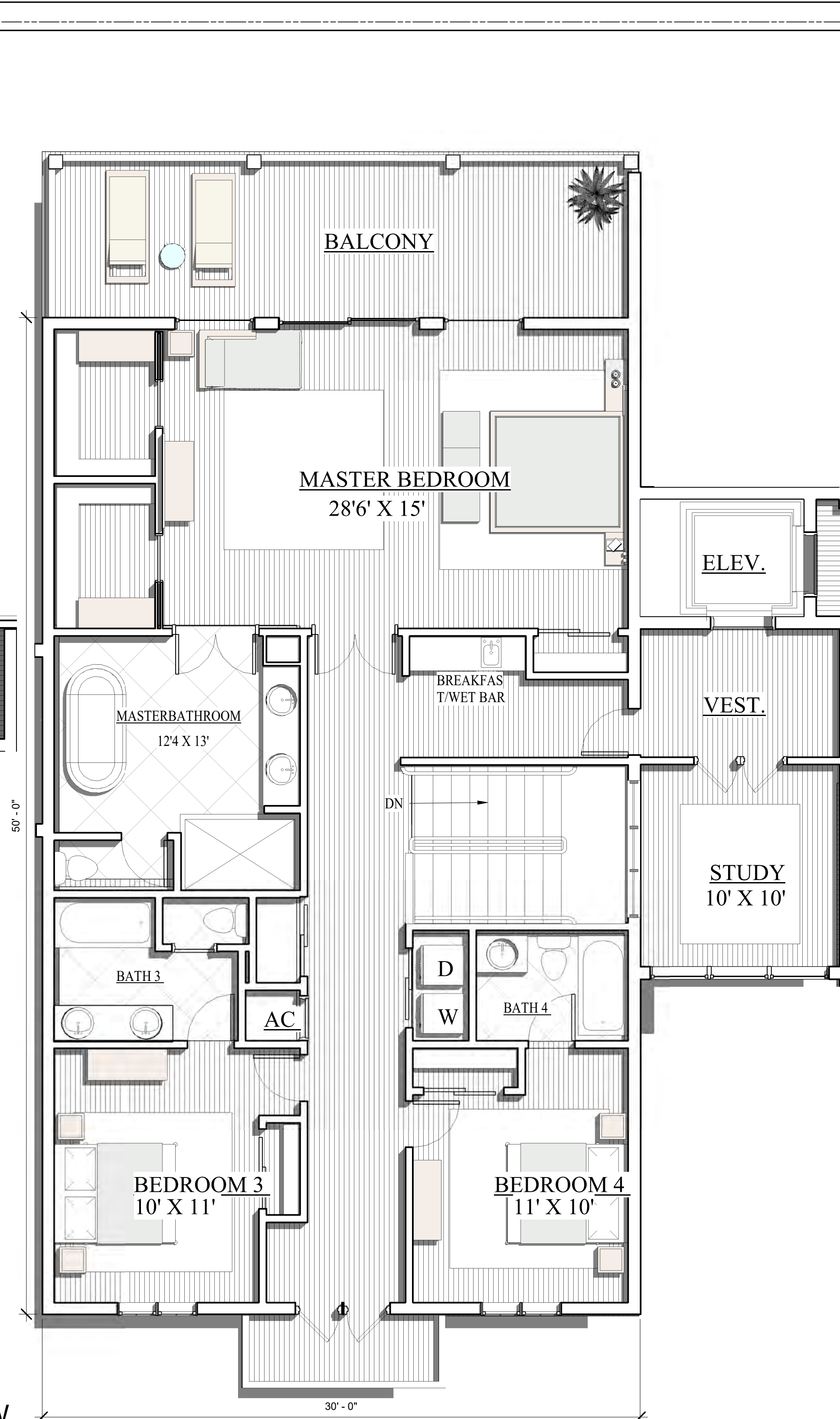
UNIT 1 3RD LEVEL FLOOR PLAN