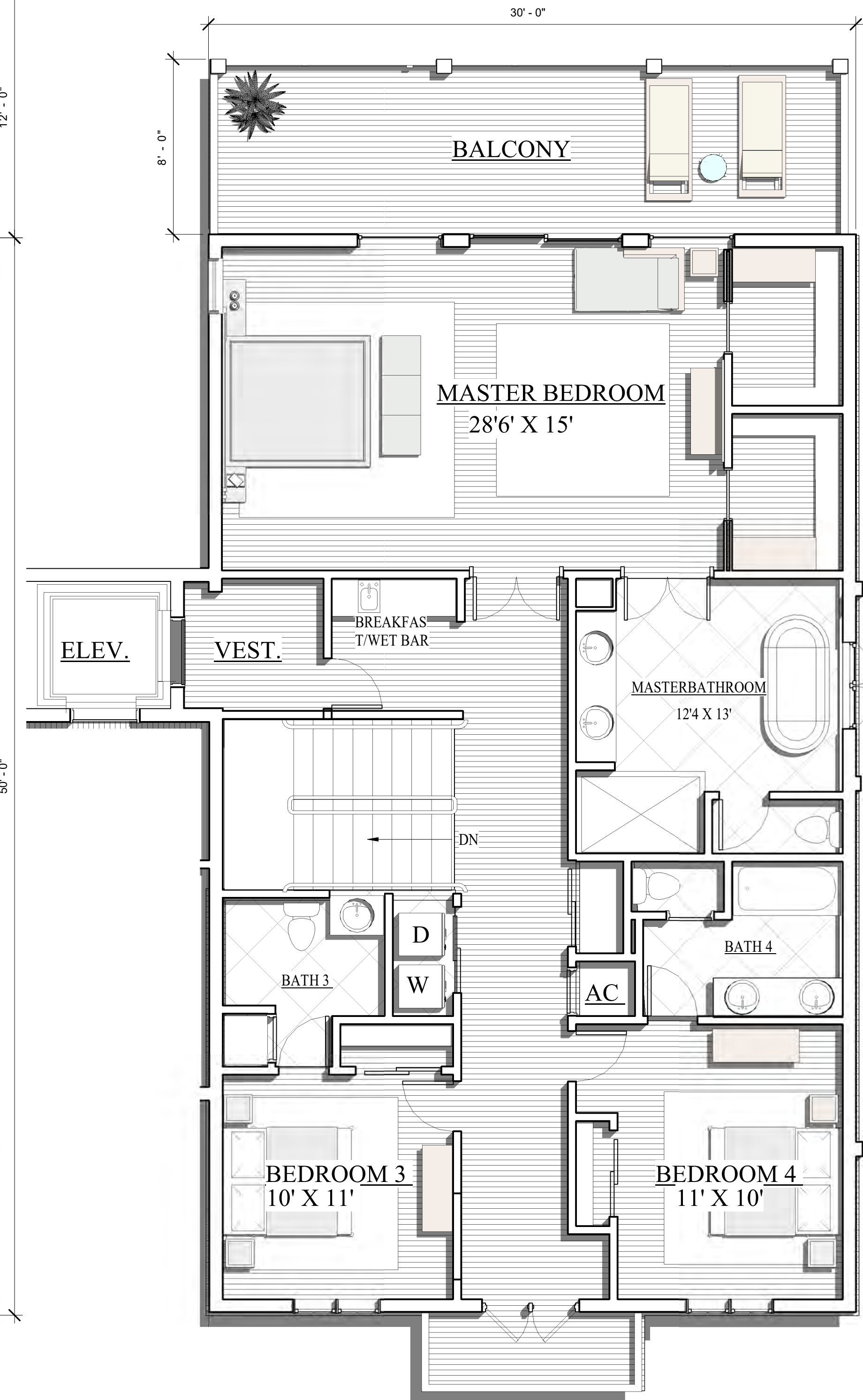
UNIT 2 3RD LEVEL FLOOR PLAN

* SQUARE FOOTAGE TOTAL INCLUDES EXTERIOR WALLS BUT NOT COMMON SHARED WALLS. THE TOTAL DOES NOT INCLUDE THE LANAI, ENTRY, OR LOWER LEVEL SPACES. THE ELEVATORS ARE NOT INCLUDED. THE STAIRWAY IS ONLY COUNTED ONCE.