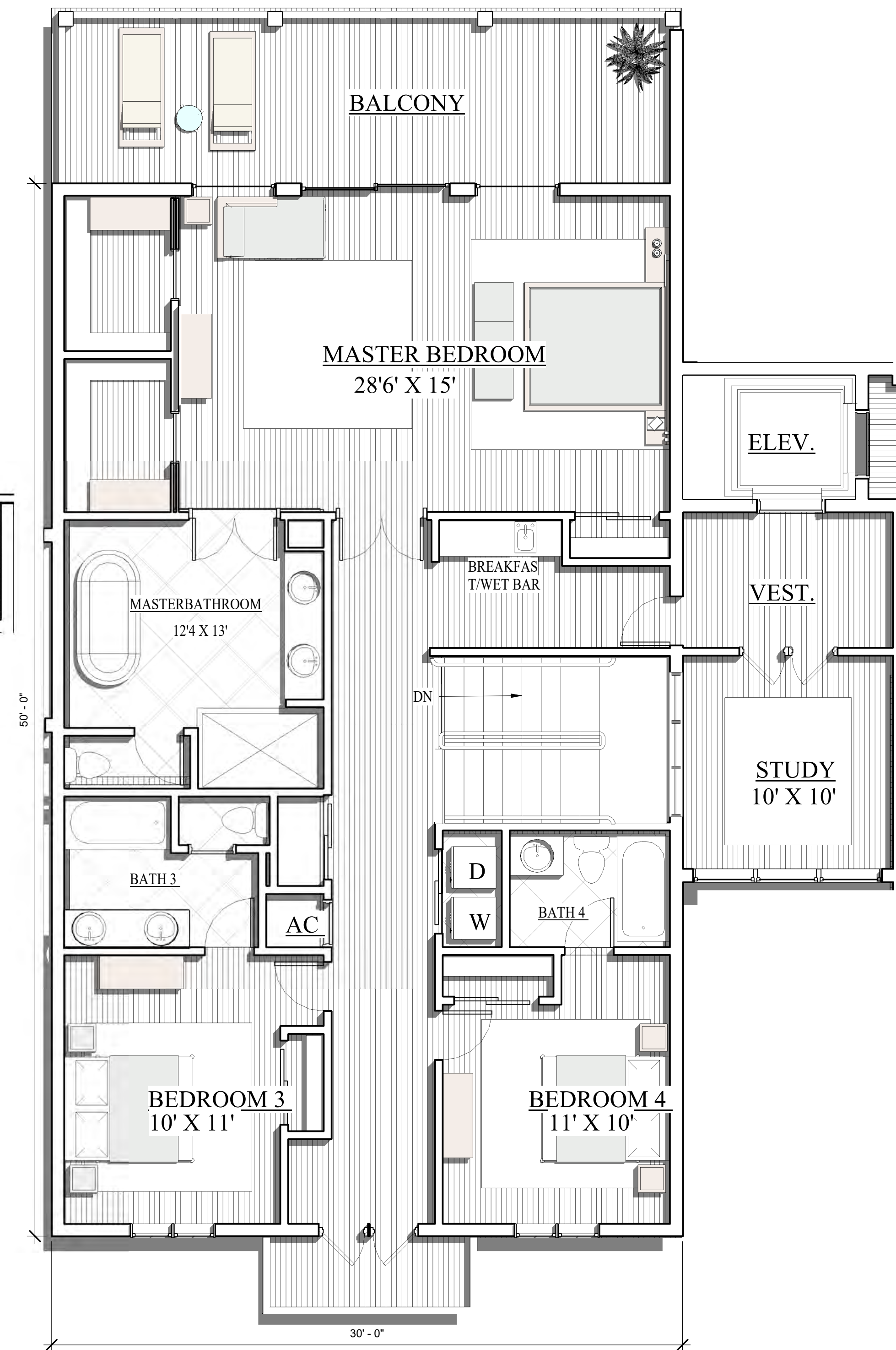
UNIT 31 3RD LEVEL FLOOR PLAN