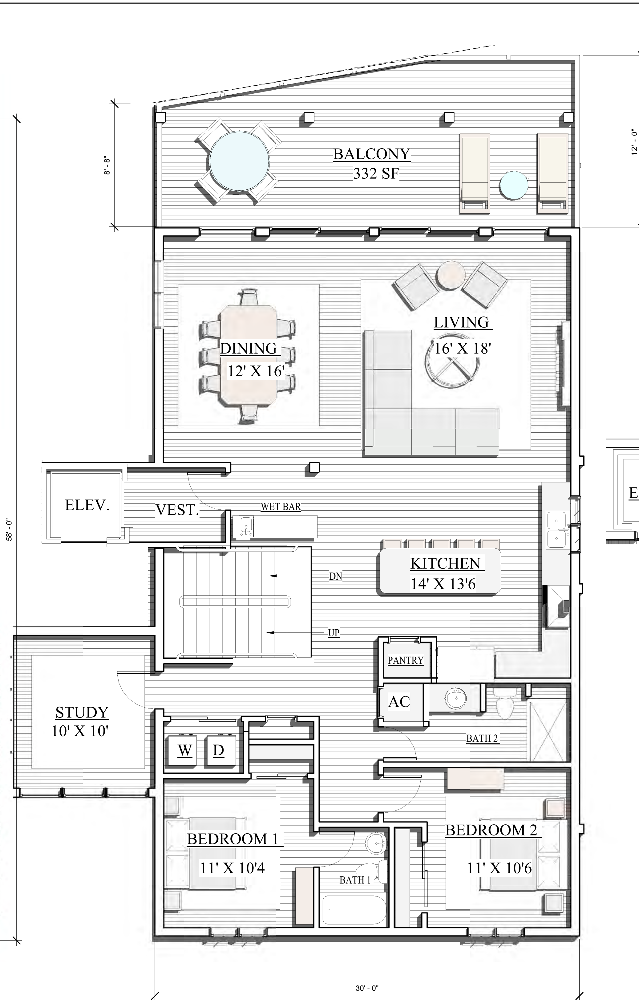
UNIT 4 2ND LEVEL FLOOR PLAN