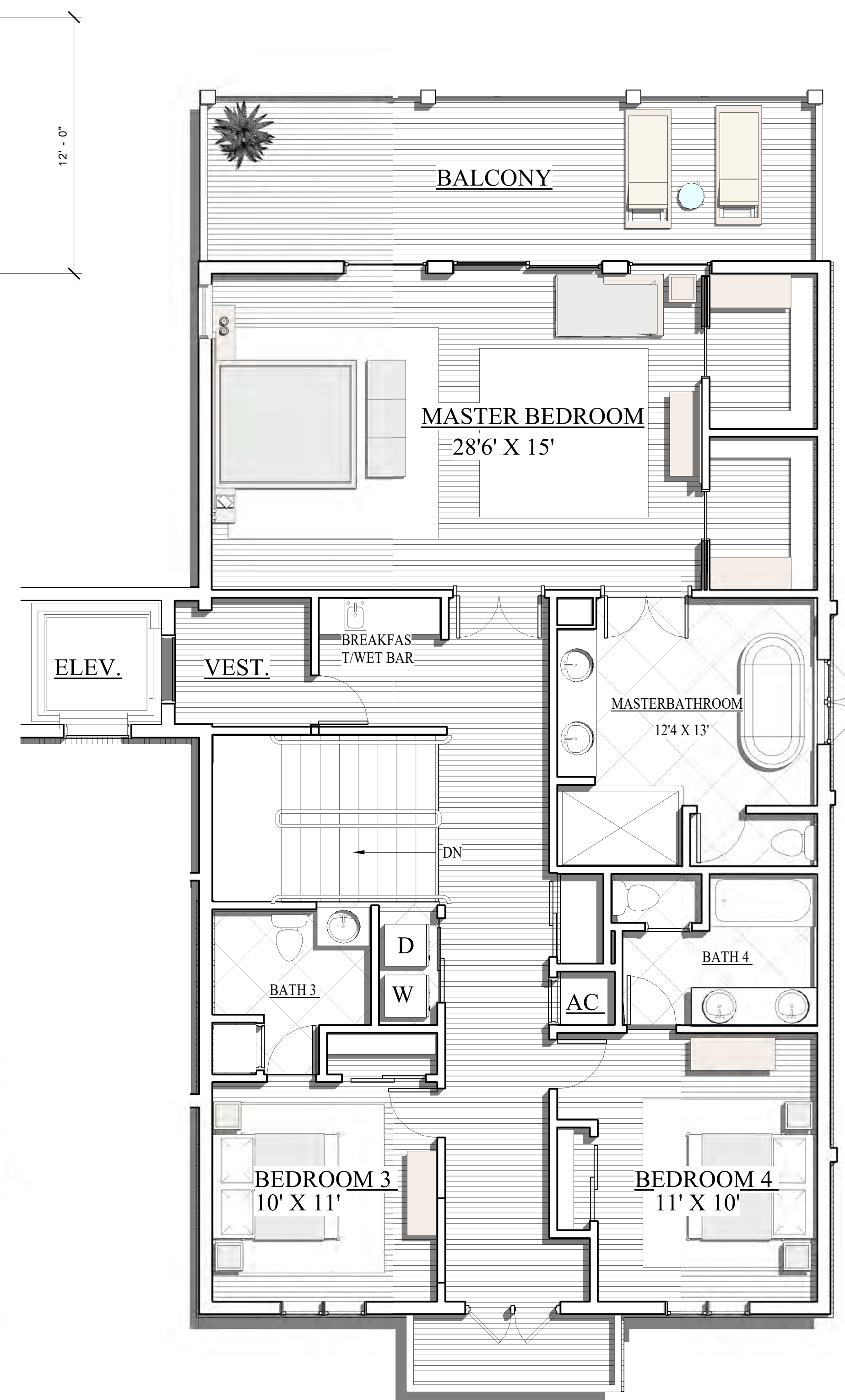
UNIT 4 3RD LEVEL FLOOR PLAN

* SQUARE FOOTAGE TOTAL INCLUDES EXTERIOR WALLS BUT NOT COMMON SHARED WALLS. THE TOTAL DOES NOT INCLUDE THE LANAI, ENTRY, OR LOWER LEVEL SPACES. THE ELEVATORS ARE NOT INCLUDED. THE STAIRWAY IS ONLY COUNTED ONCE.