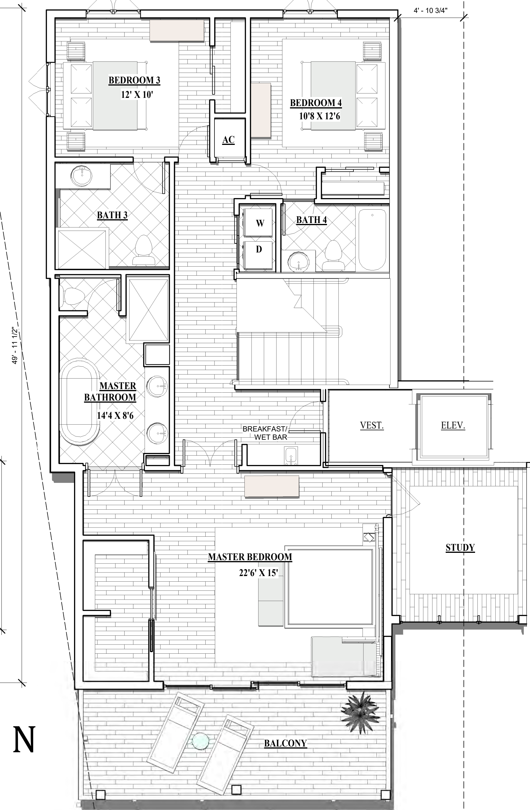
UNIT 5 LEVEL 2 FLOOR PLAN