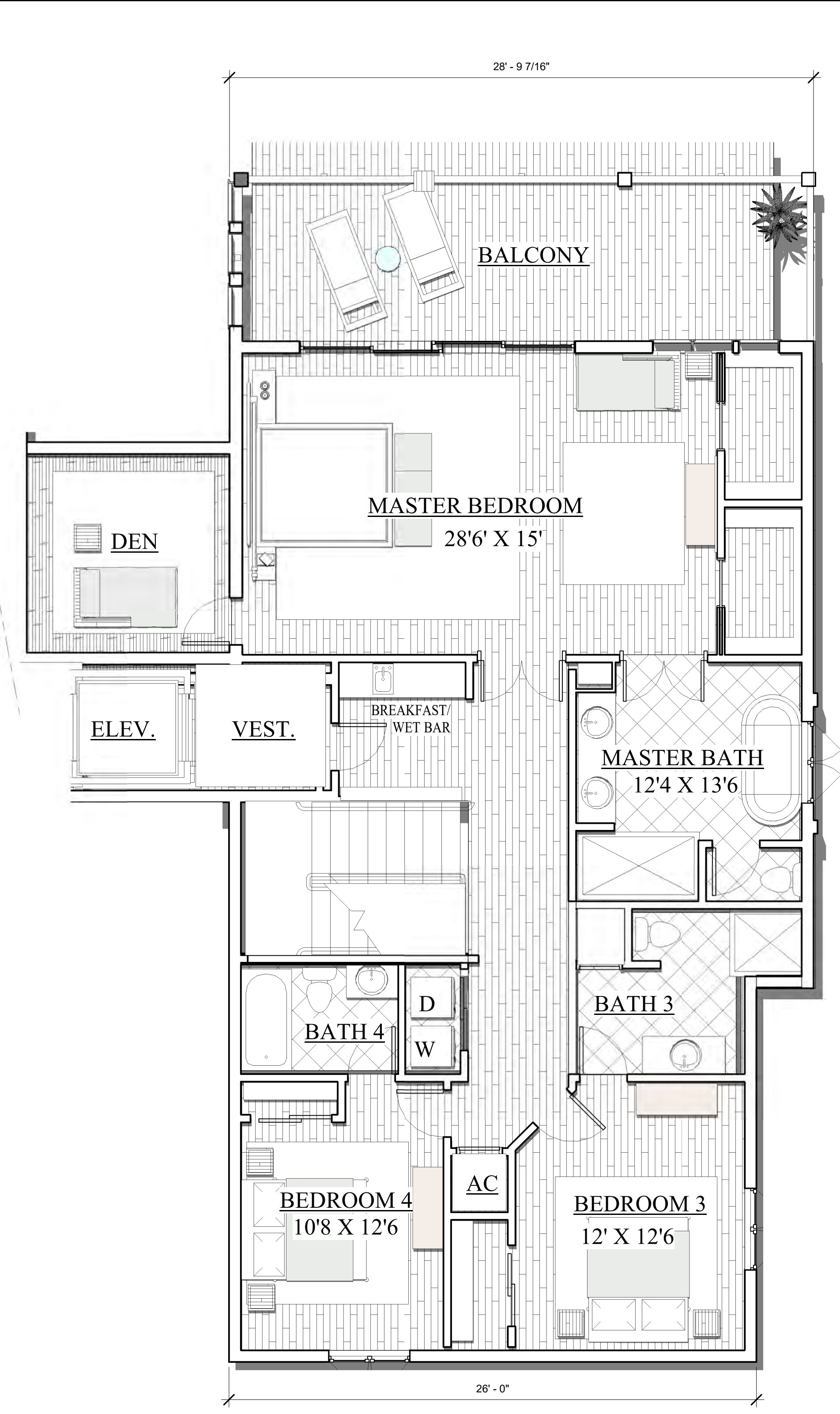
3RD LEVEL 1490 SF BALCONY 240 SF UNIT 9 LEVEL 3 FLOOR PLAN